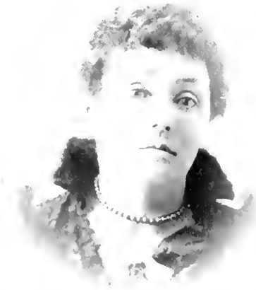
MARY HARTWELL CATHERWOOD.